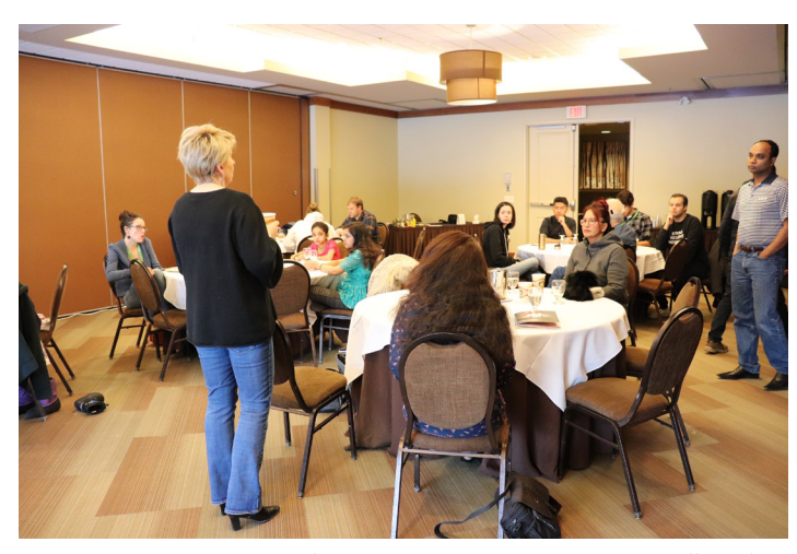
▶ February 2020 Writing Retreat, Elk Ridge

Three Annual Gatherings took place (2018, 2019, 2021). These included student, faculty, and keynote presentations, cultural and social activities, and field trips to learn from Indigenous health practitioners.